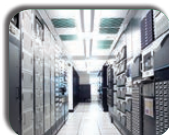
Data Center Management