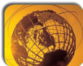
Remote Device Management